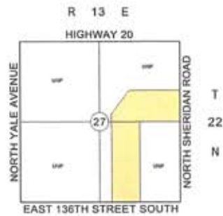
Location Map SCALE: 1"=2000'